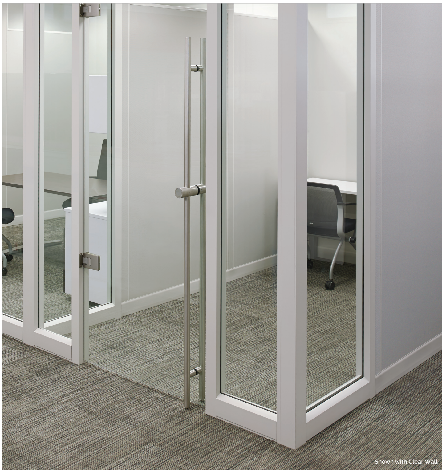
Shown with Clear Wall

Combine TrendWall's practical performance with the unlimited design flexibility of Volo and the sleek presence of Clear Wall. Fellowes' Modular wall products blend smoothly to provide a full range of aesthetic, functional and budget options.